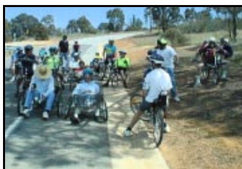
Competitors await the start of the time trial in one of the few patches of shade at the Sutton Road driver training facility.

respectively) were to record average times exceeding 35 kilometres per hour.