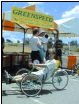
A Greenspeed hand propelled trike on show at the Greenspeed stand.