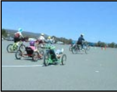
Start of the Junior Criterium for those under 14