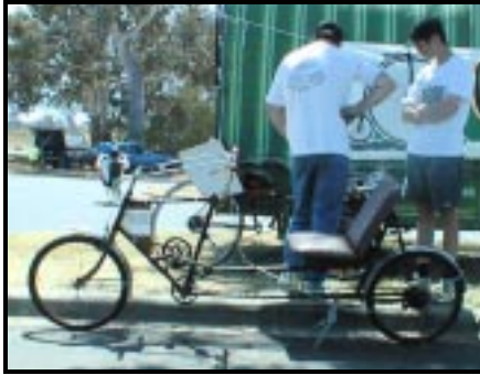
The Canberra Bike Museum has a number of recumbents from their extensive collection of bikes, including this Manx recumbent manufactured in the 1930's.

should be an even more interesting year. This year saw an increase in the number of low riders and it will be interesting to see if this trend will continue next year. We had one fully faired trike and a couple of partially faired bikes and trikes, and next year we may see more work on fairings, as this seems to be the next subject for experimentation in the search for higher speeds and better times.