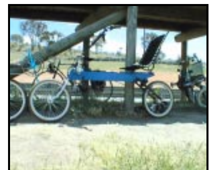
The second of Peter Holloway's designs, this one a Bike-E clone, with 20 inch front and rear wheels and rear elastomer suspension