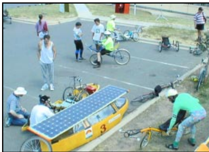
Lunch and top of the menu is ....recumbents.