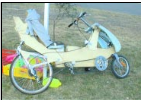
An unidentified LWB recumbent bike constructed out of plywood with rear suspension. Anyone have any more details on this bike or the owner?

And just to show that the event is just not competition here are a few photographs of the spectators at the 1997 HPV Challenge.