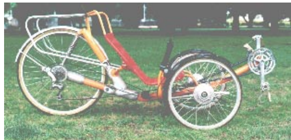
Fine Trike with 700C Rear wheel and rack