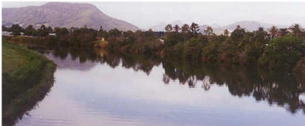
Murwillumbah, taken from the main road!

Once in Queensland the scenery changes dramatically as you head out towards Rathdowney and the Beaudesert plains. This is cattle country with unfenced roads and few trees; beware of cows mistaking your trike for the farmer's quad and food. I am chased by over 100 beasts that completely block the road in both directions, much to the annoyance of the passing motorists!