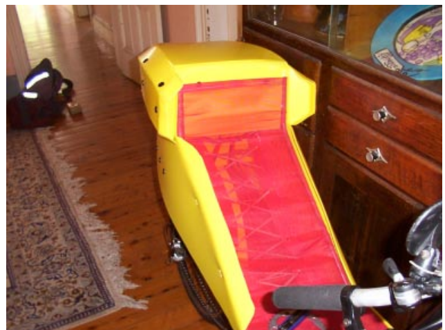
Ian Humphries new corflute tailbox

Ian Humphries - ianrjhumphries@hotmail.com