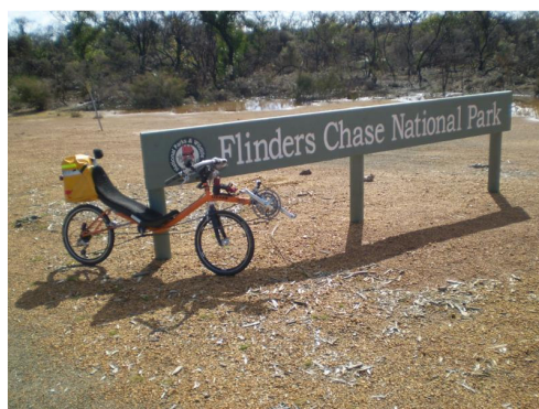
Pete’s bike takes a rest on Kangaroo Island

I reckon that both efforts - the 1985 one and the 2008 one were of equal difficulty in their respective ways.