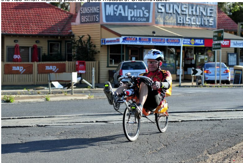
Carefully over the train tracks – first night

Being the only bent on the 1,200km drew the usual comments and derision. Generally Audax riders are every tolerant of me on my recumbents and on this ride all were except one. This guy was a dyed in the wool roadie and was quickly organising riders into packs and making sure everyone did what they were told. I soon got frisky at the average pace of the marshalled roadie bunch and looking at blokes in white nicks arse's isn't very attractive, so off down the road I went. As I passed the group I caught some snide comment from Mr Organiser like "get that f'ing thing off the road" . Fair enough! Anyway, there was a great tailwind and flatish roads the first night so I pushed on with my friend Mr Garmin to the first control at Port Arlington. Trouble was the organisers weren't quite ready when I arrived. The "bunch" was another 20 minutes back, but I decided to wait and ride with them on the night leg through Geelong for safety reasons (ie: Yobs in utes). At the Geelong control – the Kardinia 24hour take away – Mr Organiser almost stared me down and gave me an elbow in the ribs when walking past for good measure. Unbelievable!