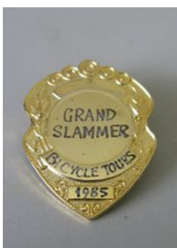
The 1985 “Grand Slammer” Badge

The ride was joined by various riders during the week. Four of us signed up for the whole week but only yours truly completed the “Grand Slam” of all four rides in the gruelling conditions. That’s 1,500kms in 9 days folks. It’s funny the ride organiser should refer to me having completed the “Grand Slam” as that is what we used to call a series of long rides leading up to a 200km distance organised by the SA Touring Cyclists when I was it’s President. When I got home I dug out an old badge I had kicking around in my treasure box.