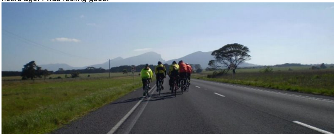
Near Dunkeld – towards Mt Abrupt