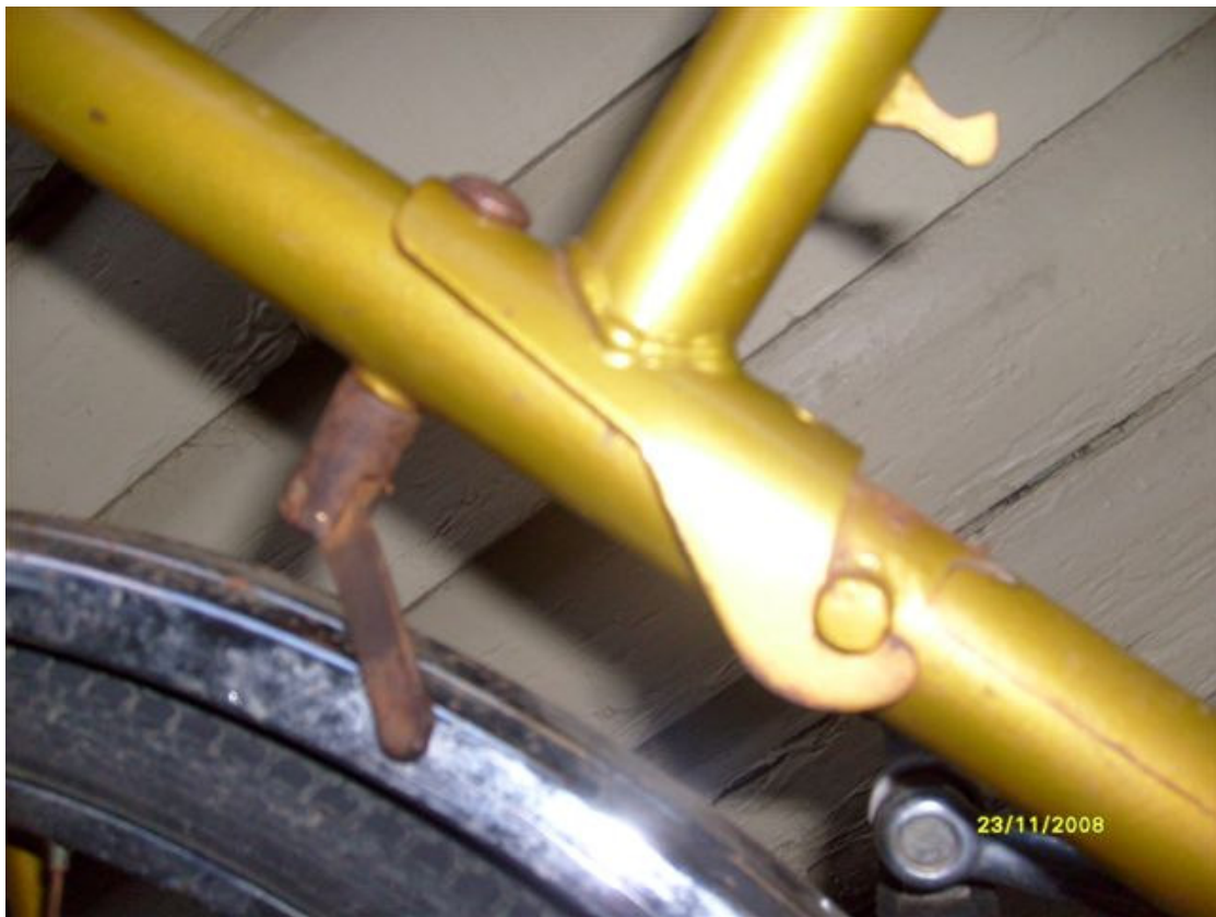
Veritas folding mechanism

The separable bikes have been a lot of fun to use, and I would generally ride one of these for a round trip of 3k or less, getting into and out of my faired recumbent really isn't worth it for these distances.