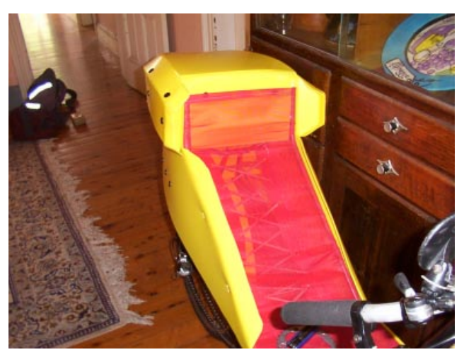
Ian Humphries new corflute tailbox

Ian Humphries - ianrjhumphries@hotmail.com