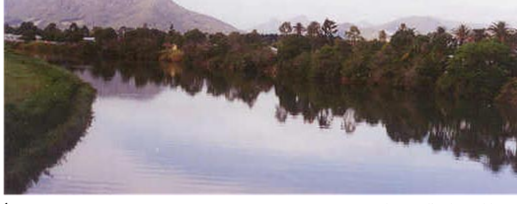
Murwillumbah, taken from the main road!

Also I realised I could get up just about any hill, albeit slowly. And I learnt that