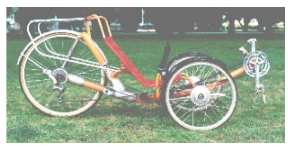
Fine Trike with 700C Rear wheel and rack