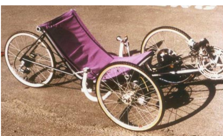
University of Canterbury's Tricanter

Our main publication is a bimonthly newsletter, printed in full colour and normally four pages in length. Each issue contains info on new local HPVs, reviews of recent HPV material plus news of overseas records. Every alternate newsletter is accompanied by what we call a Special Issue, which is also printed in full colour, where a single subject is covered in depth. Sometimes it is a written description of an HPV by its owner or designer. Other times it is a technical analysis that s been written up by one of the (many) engineers within the club. One such Special Issue was a both a how-to guide and a technical analysis about conducting roll-down testing. We