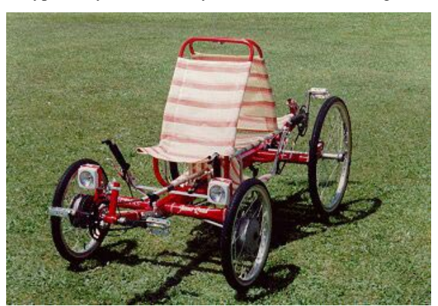
Janus Quad - a back-to-back tandem with independent drive, made in 1994.

The homebuilt has not been a static breed either, with there being a steady and impressive rise in the quality of this type of cycle over the years. The level of thought and