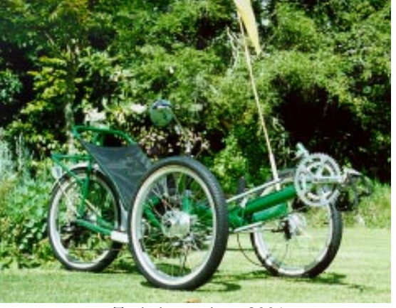
Trebelo, made in 2001

Most Kiwi bent cycles are of the normal variety, but experimental types have also appeared. Prolific builder Bill LeGros has made a FWD FWS machine, whilst Len Grimwood of Dunedin